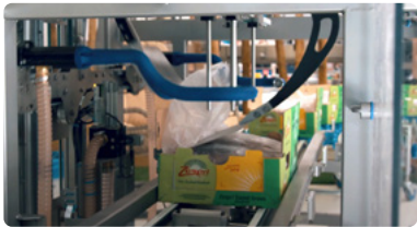
4 Bag folding