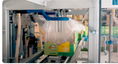
2 Bag pick-up