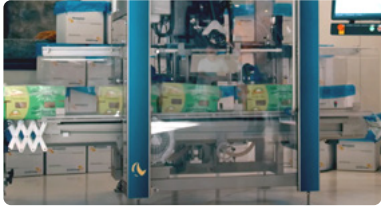
1 Box infeed