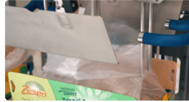
3 Creating sidefolds