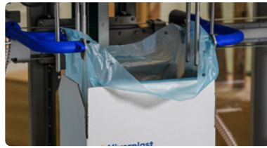
2 Bag pick-up