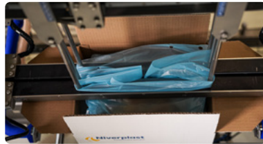
5 Bag sealing