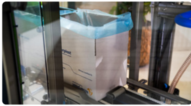
1 Box infeed