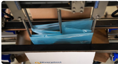
4 Bag spreading and gusseting