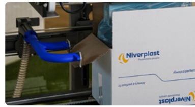
3 Side flap folding