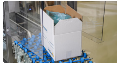
6 Box outfeed