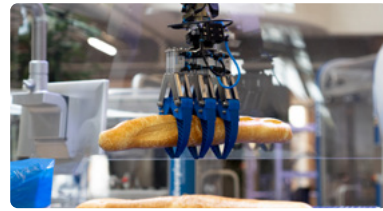
3 Product pick up