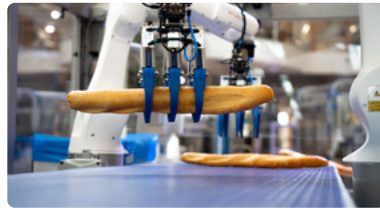
5 Repetitive handling