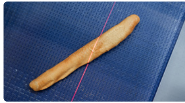
2 Product scanning