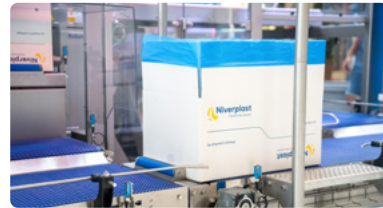
6 Box outfeed