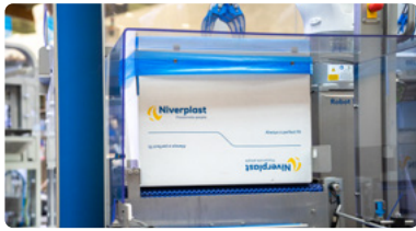
1 Box positioning